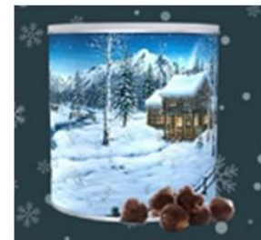
Chocolatey Caramel Crunch Tin

Limited Time Only—Free Shipping on orders of $30 or more