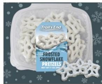
Frosted Snowflake Pretzels