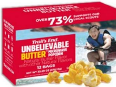
Unbelievable Butter Microwave