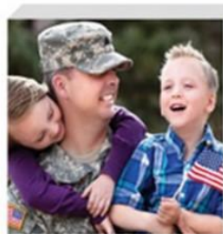
American Heroes Donation