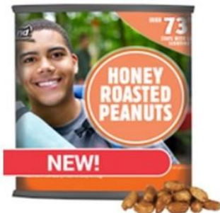
Honey Roasted Peanuts

Scouts and Leaders, the Trail's End Popcorn Sale continues on via Online Direct Sales. Any Scout can participate in Online Direct Sales and earn funds for their Scouting experiences. Free shipping for all orders $30 and more will also continue.